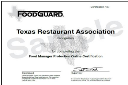
Texas Restaurant Association

The below examinations are accredited by the Texas Department of State Health Services using standards set by Conference for Food Protection and developed following the strictest test development procedures. These examinations are accepted in *Texas Only