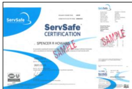
National Restaurant Association Solutions, LLC